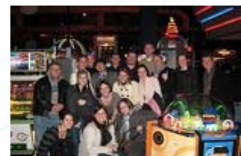
Saturday, 17 th – Closing Event