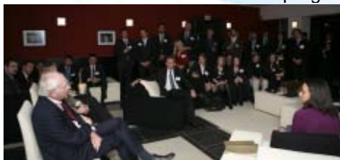
Friday, January 16 th – Berlin Bar at Ambassador Residence