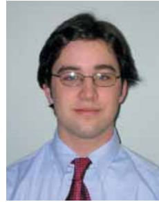
Burke P. Dignam